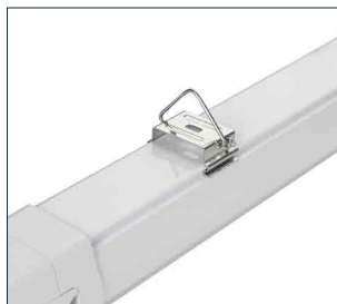
Adjustable ceiling clips