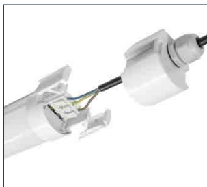
2xM20 - Fast connector